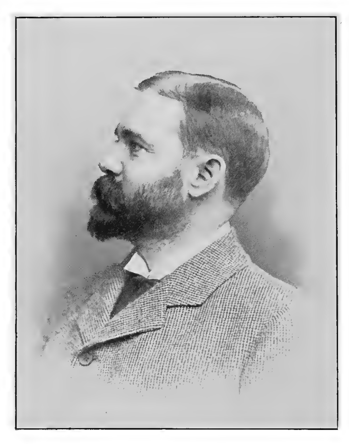
VICTOR F. LAWSON, Of the Chicago "Record" and "Daily News."